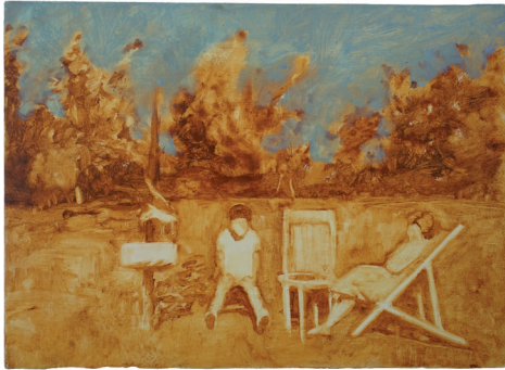
'Sitting in the Garden' , oil on board, 15 x 21cm