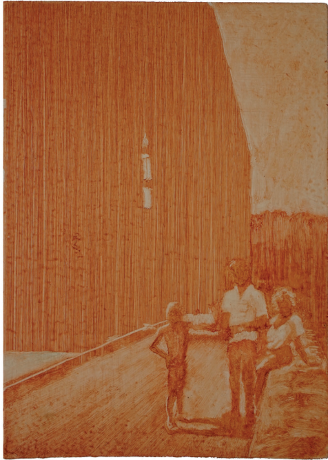
'Pont du Gard on wall' , oil on board, 21 x 15cm