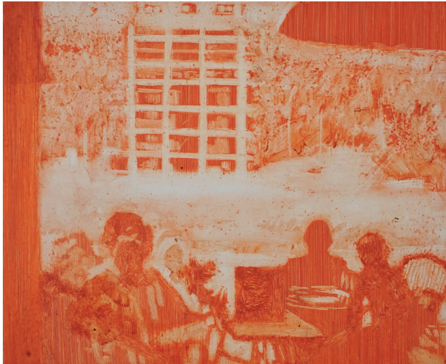
'Marimar' , oil on board, 19 x 23cm