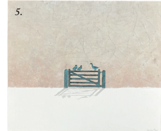
1. Ann Ruddy, 'Bowl of Lemons', oil on board, 15x15cm 2. Jo Perkins 'Glade' 80x60cm stretched canvas 3. Barbara Peirson, 'Catching the Light, Loch Tay', mixed media on wood panel, 35x40cm 4. Rosie Hay, Celadon Handpainted Landscape Design Moonjar, 13.5x16cm 5. Christian Moore, 'duck duck goose', minerals, pigments and aged cold cast bronze on hessian, 50x60cm